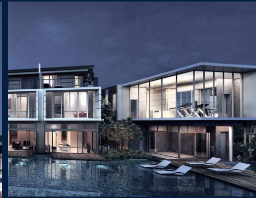
5-Bedroom + Family + Utility